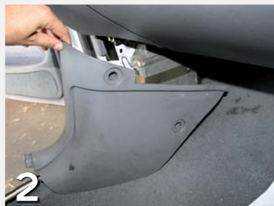
▲ Remove the left-hand-side kick panel by removing the two plastic plugs