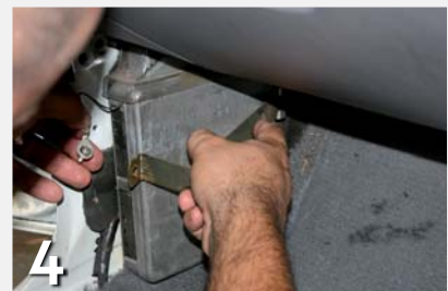
▲ Remove the Phillips head screw holding the ECU support strap, noting the earth attached to this screw