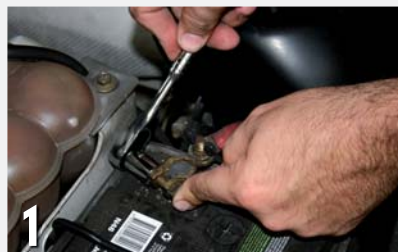
▲ Disconnect the battery

Read on for the installation and company contact details. ■