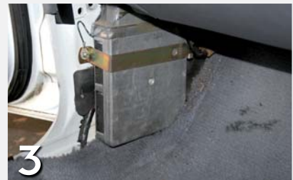
▲ Here is the ECU exposed